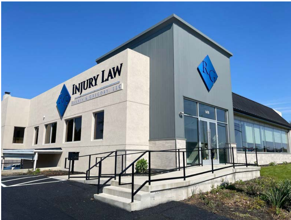
Rankin & Gregory LLC ~ RG Injury Law's New Office Location at 1476 Lititz Pike, Lancaster, PA 17601

The spacious, bright new office offers an ideal location for clients' easy access from Routes 30, 283, 222, and Lancaster City. It also provides the optimal space for safely serving their injured clients while adhering to COVID-19 and post-pandemic safety measures because it offers ample space to accommodate physically-distanced meetings, an Iwave air purification system (with needlepoint bipolar ionization technology), and enhanced professional CDC-recommended cleaning and sterilization procedures to ensure that the legal staff and clients remain safe even after the pandemic ends.