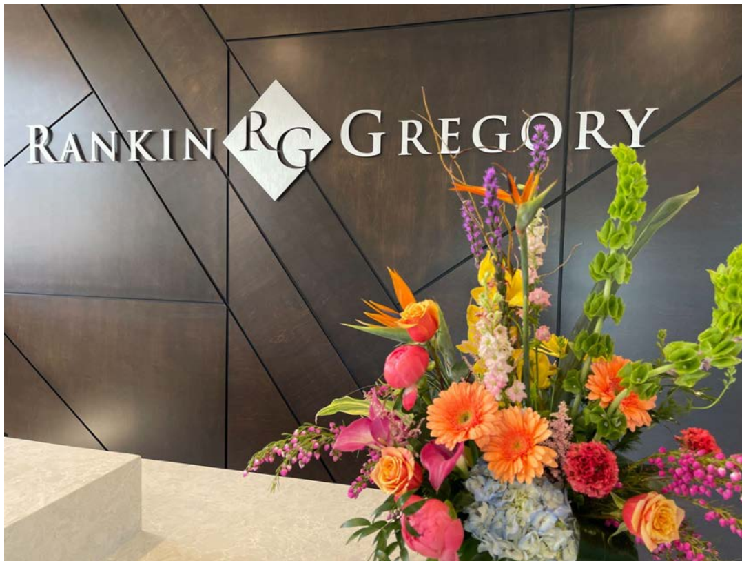
Wooden Wall Feature at Rankin & Gregory's New Main Office at 1476 Lititz Pike Lancaster PA